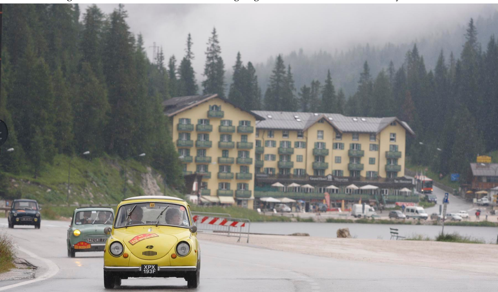
The Grand Hotel Misurina, surrounded by stunning mountains and fronted by a delightful lake, watched over the first LBL rally participants in the early afternoon of Friday, July 18, 1958. The hotel saw us pass again on July 14, 2008 (in the rain!) and will host the rally on July 14 next year. It can spare just 40 rooms, so book now!

Another big difference this time, is that we're going for smaller hotels outside city centres as much as