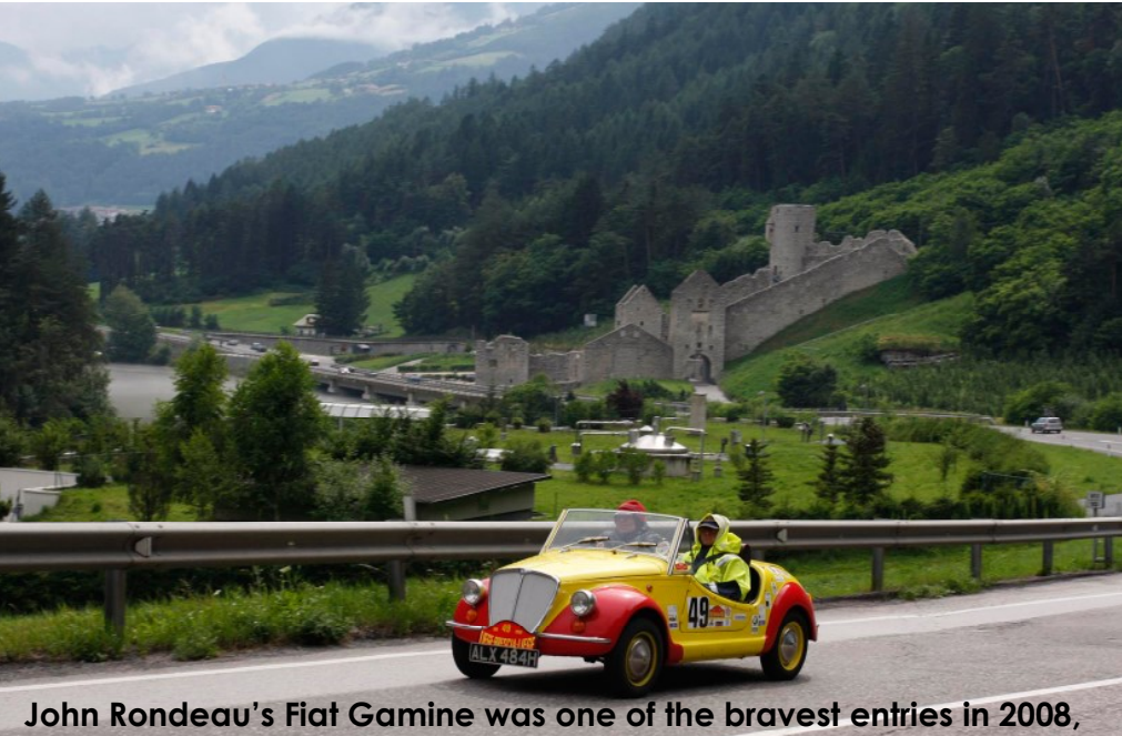
as they had no hood – and he's back for more punishment this year!

Coming back to 2018, we've put all US entrants in email contact with each other so they can explore economies in shipping (four or even six micros in one 40ft container costs