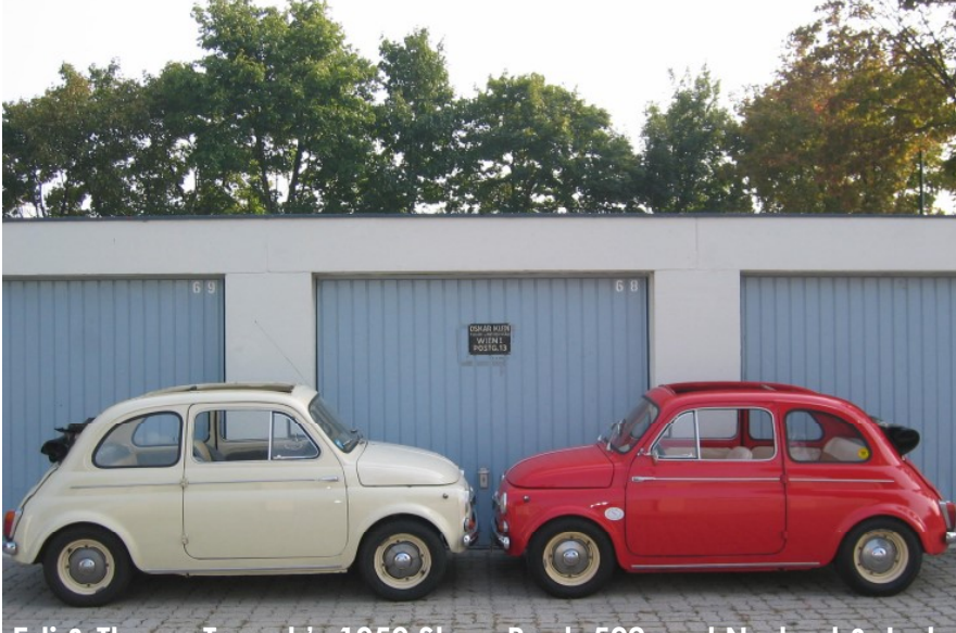
Edi & Theres Tomek's 1959 Steyr-Puch 500 and Norbert & Judy Mylius' 1962 Steyr-Puch 650TR: great competitors from Austria!

For plotting the route on the maps, all navigators have their own preferences so you might like to try at home well in advance. The Freytag & Berndt maps which we use are quite highly coloured, so it can be difficult to make out the marks you've made – and you need to bear in mind that at the end of the event, we return up some of the same roads, so you will need to use the maps twice. Obscuring the detail with thick marker pens is unwise, as details like rivers, churches, hills etc can help you locate yourself if the roads become unclear. A good quality 4B pencil line up each side of the chosen road can be a useful marker – easily erased to check detail