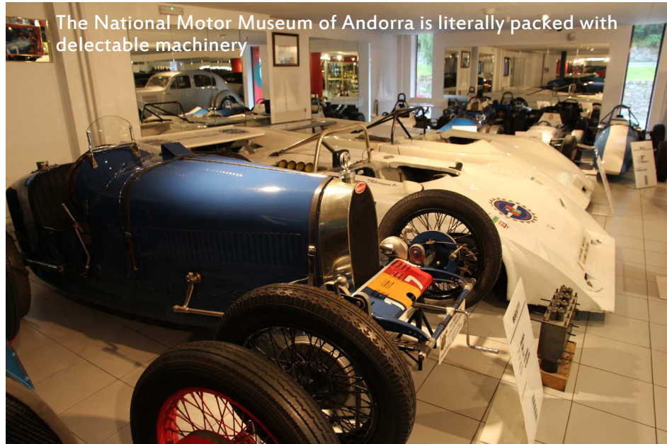
The National Motor Museum of Andorra is literally packed with delectable machinery