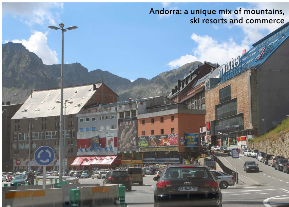
Andorra: a unique mix of mountains, ski resorts and commerce