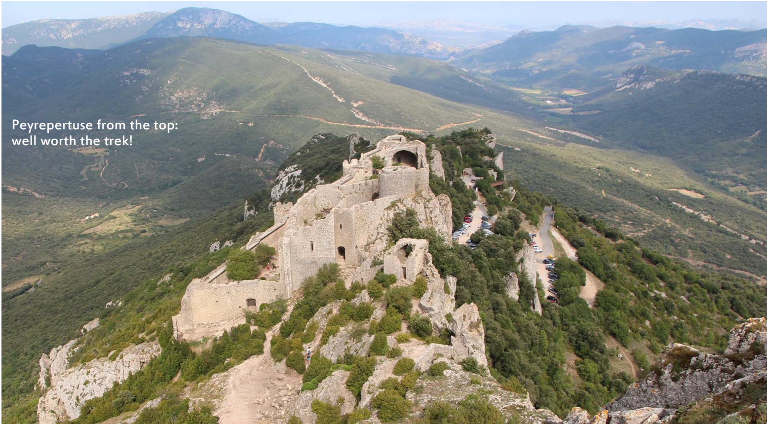
Peyrepertuse from the top: well worth the trek!

everyone has arrived, we are invited by the Associació Andorrana de Vehícles Antics to follow a Police escort to the capital city, Andorra la Vella, and to parade through its streets, before heading further up into the mountains to our delightful ski resort hotel, Sport Hotel Village at Soldeu.