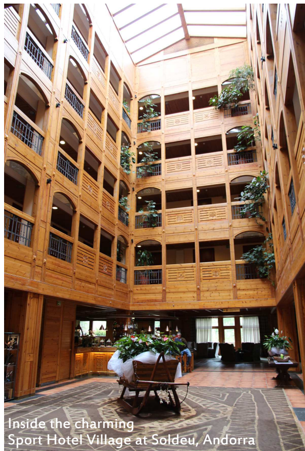
Inside the charming Sport Hotel Village at Soldeu, Andorra