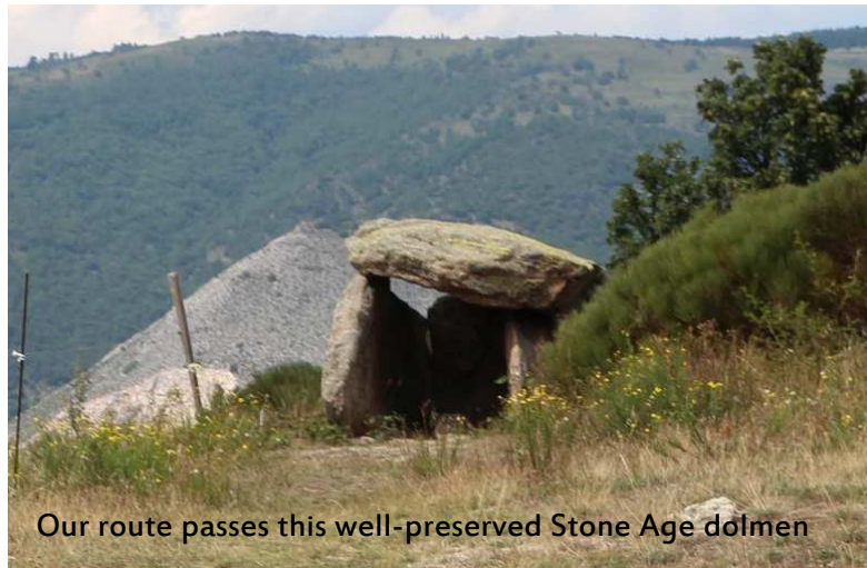
Our route passes this well-preserved Stone Age dolmen