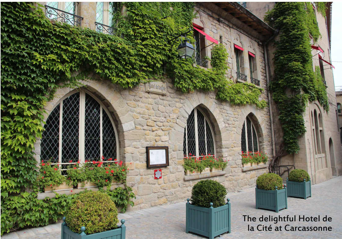
The delightful Hotel de la Cité at Carcassonne

everyone has arrived, we are invited by the Associació Andorrana de Vehícles Antics to follow a Police escort to the capital city, Andorra la Vella, and to parade through its streets, before heading further up into the mountains to our delightful ski resort hotel, Sport Hotel Village at Soldeu.