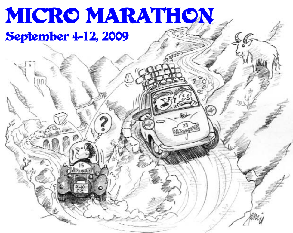
DID YOU HAVE TO BUY ALL THAT GOAT CHEESE?