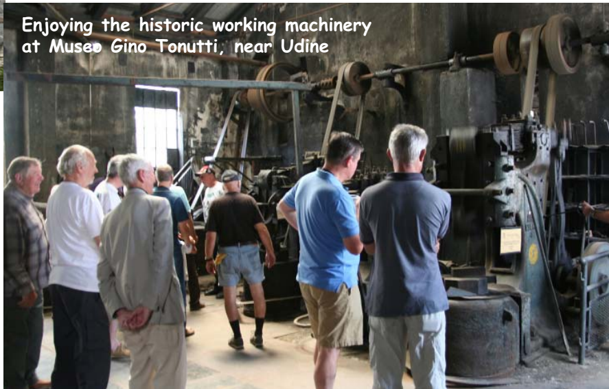
Enjoying the historic working machinery at Museo Gino Tonutti, near Udine

jack-up oversteer for their pains. Sometimes it pays to keep the boot full!