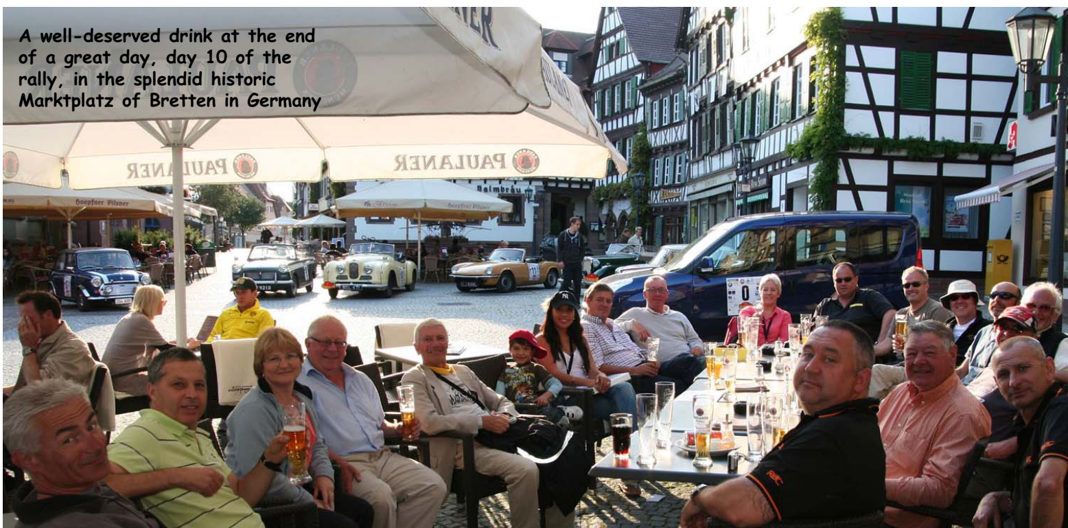
A well-deserved drink at the end of a great day, day 10 of the rally, in the splendid historic Marktplatz of Bretten in Germany