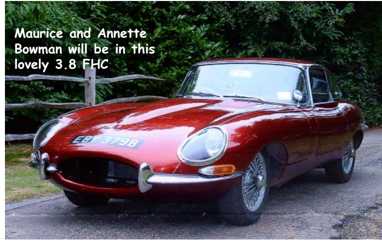
Liège-Brescla-Liège 2012 is held in conjunction with the International Jaguar XK Club and the Jaguar E-type Club