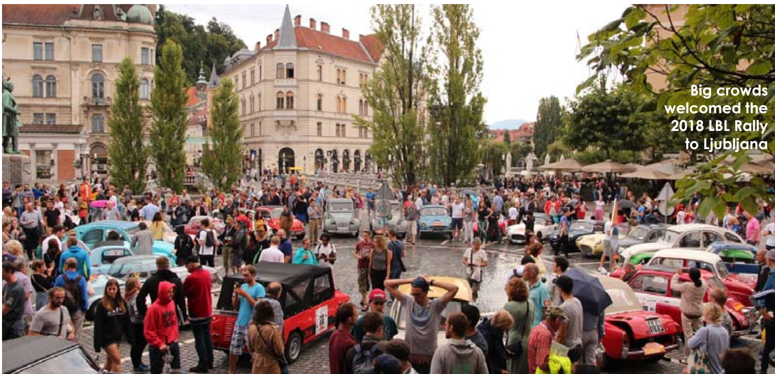
Big crowds welcomed the 2018 LBL Rally to Ljubljana

Welcome Dinner, speech from 1958 LBL competitor, Remo di Cocco; meet your fellow participants Formal start as 1958: Palais des Princes Evêques, then Spa, the Ardennes, Liedolsheim circuit test Black Forest to the mountains, Austria, Brenner Pass, fabulous final climb to lakeside hotel at 1752m Glorious Dolomites, superb passes inc Vrsic in Slovenia reception in the Prešeren Square, heart of Ljubljana Explore this delightful, cosmopolitan capital city Super-smooth gravel road, amazing private museum, great passes on the 'Route des Cols', Dolomite-top hotel The Stelvio and the Gavia, beautiful Lago Iseo, police escort to Brescia piazza, stunning historic palace hotel Mille Miglia Museum, lap consistency at Franciacorta circuit, Gavia & Stelvio 'the back way' Beautiful Passo Pennes, through Austria 'the old way', fun navigation test, lakeside hotel at Starnbergersee Black Forest sweeping roads, multiple car museum visits, Schloss Lichtenstein, mediaeval Marktplatz finish Delightful kart circuit test, Ardennes, finish at Spa circuit museum, Prizegiving Dinner with lots of trophies Breakfast; departure