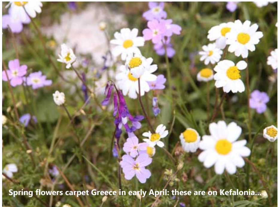
Spring flowers carpet Greece in early April: these are on Kefalonia...

Ideally we need to board the overnight ferry to Igoumenitsa by 17:30, so Alitalia from London City via Milan (09:00-14:55), or Air France from Heathrow via Paris (09:00-16:50), look the best single-operator options, but more may become available (and prices will reduce) over the next few months. Dual-operator opens many options, one of the most attractive being British Airways Heathrow-Rome 10:00-13:40, followed by Alitalia Rome-Bari 15:25-16:30 (and of course you can fly to Rome from many regional airports). Three months in advance is said to be the ideal time to book flights in terms of cost and availability, so we'll monitor the situation.