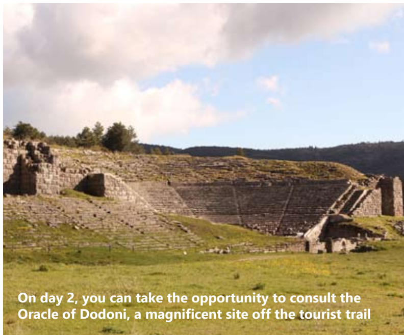
On day 2, you can take the opportunity to consult the Oracle of Dodoni, a magnificent site off the tourist trail