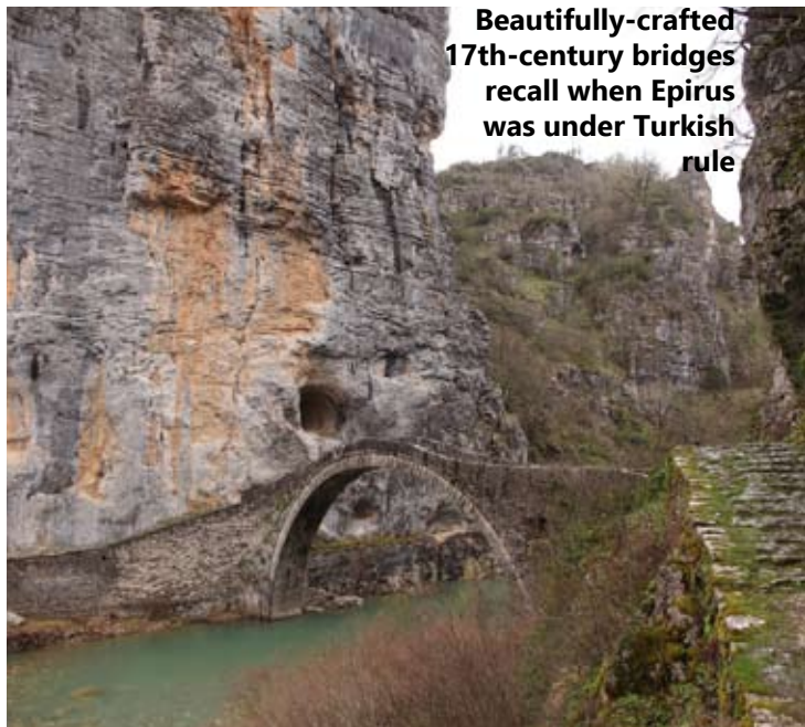
Beautifully-crafted 17th-century bridges recall when Epirus was under Turkish rule