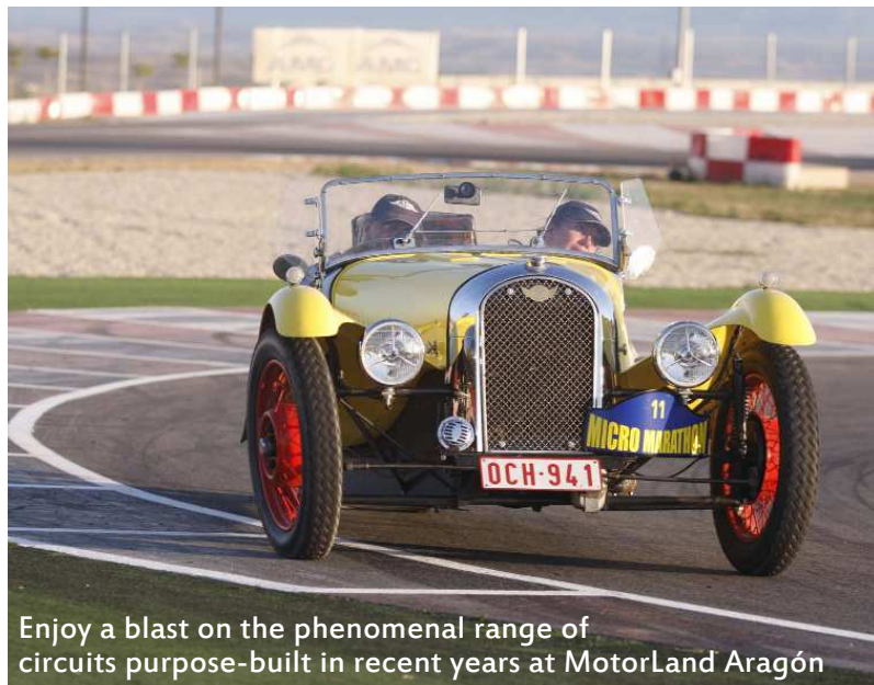
Enjoy a blast on the phenomenal range of circuits purpose-built in recent years at MotorLand Aragón