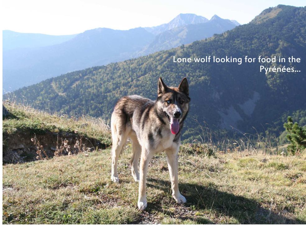
Lone wolf looking for food in the Pyrénées...

We are working with French railways, SNCF, to combine their overnight motorail service from Paris to Toulouse with their high quality overnight sleeper service on the same route, so that you can take a midday or early afternoon Eurotunnel train to Calais on Thursday, August 29, a gentle drive down to Paris and meet up with us at Paris Bercy Auto-train terminal, where your car will be loaded. We will then enjoy the first rally dinner together before transferring to the sleeper terminal, Paris-Austerlitz, to be wafted to sleep en route to Toulouse. You awake at Toulouse in time for a quick breakfast, before collecting your cars and motoring to our nearby start location: by lunchtime on Friday, you are rallying in the Pyrénées. At the end of the rally, a similar formula will whisk