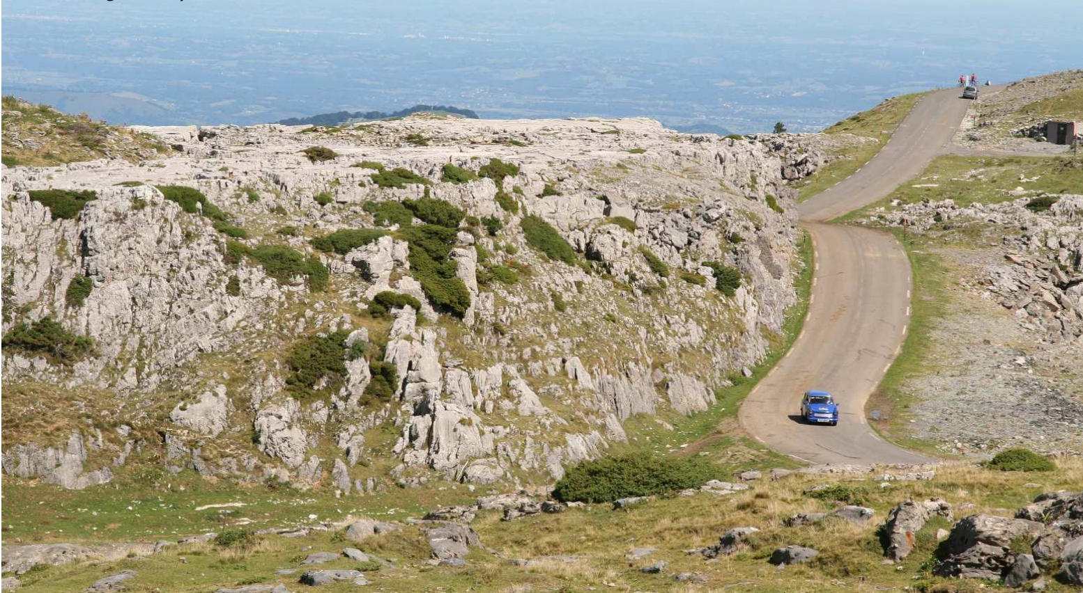
Astounding scenery, deserted roads...