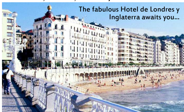
The fabulous Hotel de Londres y Inglaterra awaits you...

IBAN: GB88 ABBY0901 5005807379, BIC: ABBYGB2LXXX.