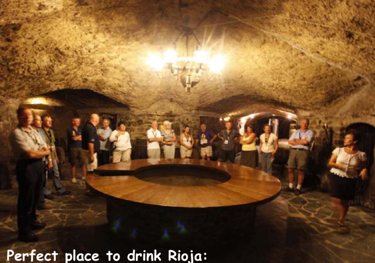
Perfect place to drink Rioja: underground at Bodegas Heredad Ugarte

The event will be run to our popular navigation/competition/circuit tests/sightseeing/local visits formula, the first time it has been used in the UK, and we expect to be over-subscribed for the 30 places available: get your name on the list now!